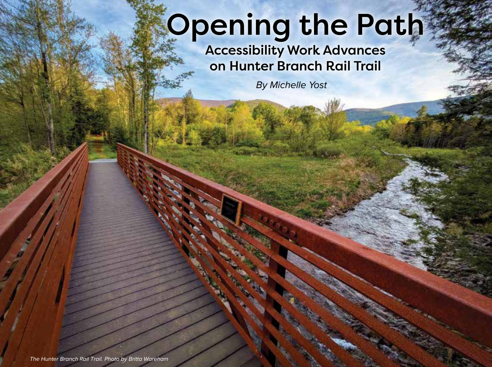
The Hunter Branch Rail Trail.

J ust imagine it: walking or biking from the iconic Kaaterskill Falls all the way to Dolan's Lake in the Village of Hunter—without ever leaving the trail. That's the bold vision behind the Hunter Regional Trails (HRT) project, a dream that's steadily becoming reality.